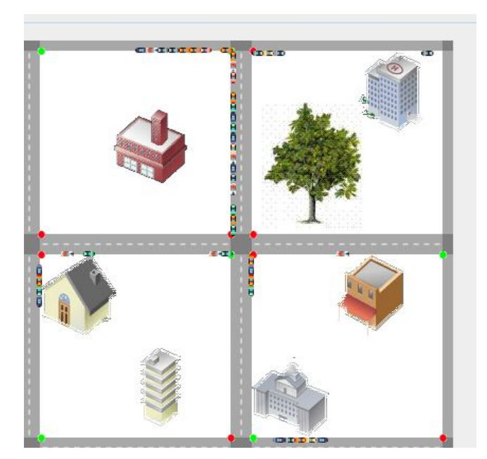
Figure 3: Traffic Jam

With these parameter settings, there is a traffic jam at one of Carrefour.