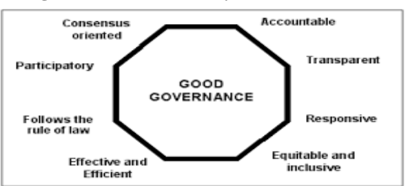
Figure 2: Characteristics of Good Governance